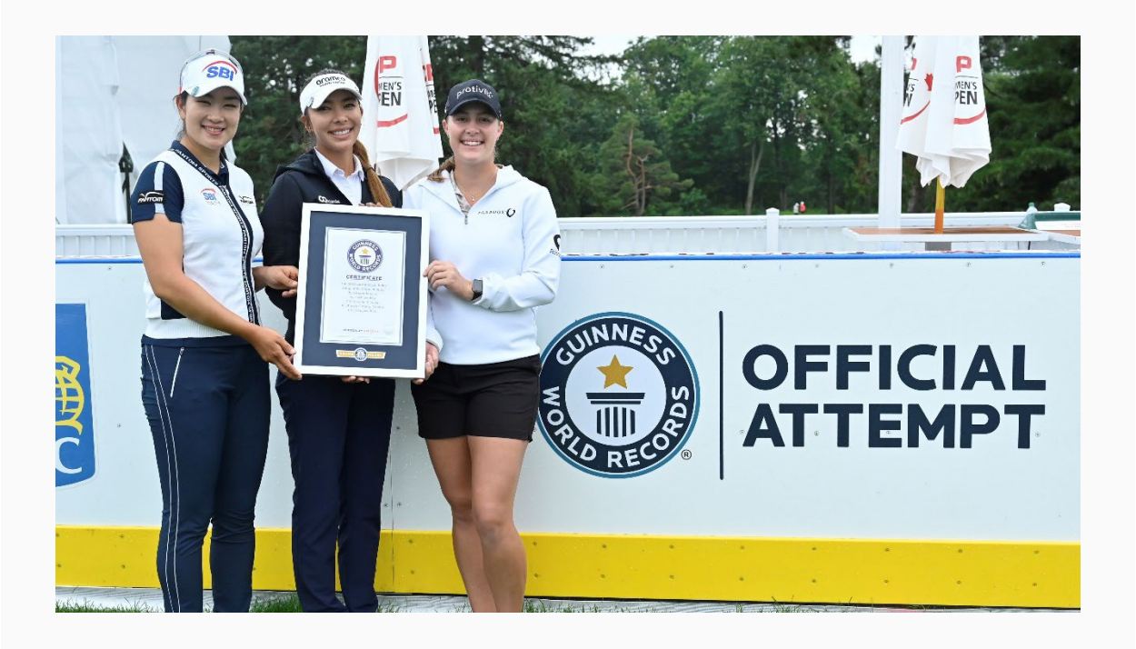
Round 1 & 2 Pairings and Start Times Now Available

(Ottawa, Ont.) – With the opening-round of the $2.35 million (US) CP Women's Open less than two days away, tournament week at Ottawa Hunt and Golf Club continues to showcase the finest in women's professional golf.